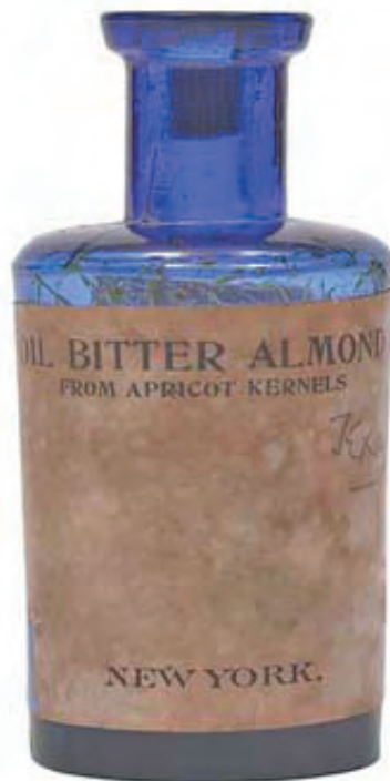
Oil bitter almond from apricot kernels.

The many varieties of seeds and nuts can produce oils for food, nutraceuticals, skin care products, aromatherapies, biodiesel fuels, and industrial lubricants. This publication profiles the evolution of a cold-pressing and consulting business in the U.S. It also describes the basic processes involved in oil processing: seed cleaning, extraction, clarification, packaging, and storage. Sources for more information and equipment are included.